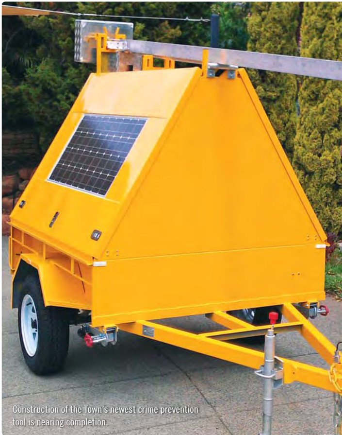
Construction of the Town's newest crime prevention tool is nearing completion.