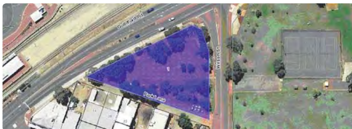
Reserve 37441: Wilson Street car park – corner of Wilson Street and Guildford Road, Bassendean Land area: 3356m 2 Zoned: Local Open Space

At its meeting on 28 August 2012, the Town of Bassendean resolved to consult the community and seek its views on the proposed acquisition of the following Crown Reserve properties: