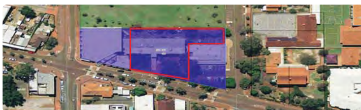
Portion of Reserve 31252: Town Administration Building – 48 Old Perth Road, Bassendean Land area: Approximately 3000m 2 (for land occupied by Administration Office only) Zoning: Town Centre