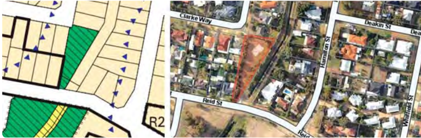
Reserve 29948: Clarke Way/Reid Street, Bassendean – Zoning map and aerial view.

AT ITS MEETING held on 28 August 2012, the Town resolved to consult the community and seek its views on the proposed closure of Crown Reserve 29948 Clarke Way/Reid Street, Bassendean. This closure will result in the relocation of play equipment and a new community facility being developed on Sandy Beach Reserve.