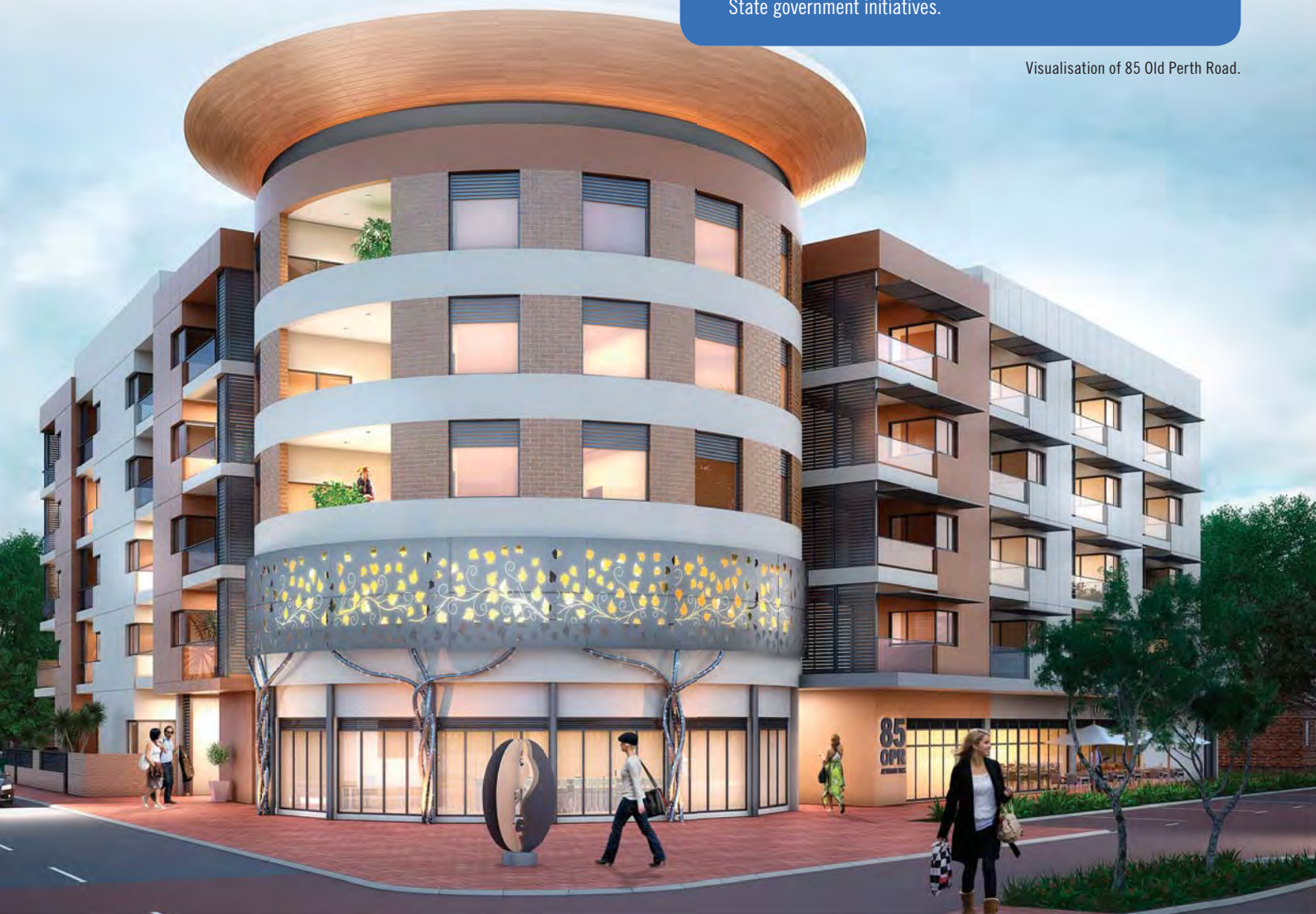
Visualisation of 85 Old Perth Road.

The business website www.bassendeanmeansbusiness.com.au is full of current information for local businesses. In addition to offering downloads of the new Economic Development Plan and the ED Annual Action Leaflet, you will find information on courses and the latest on cost savings for businesses and Federal and State government initiatives.