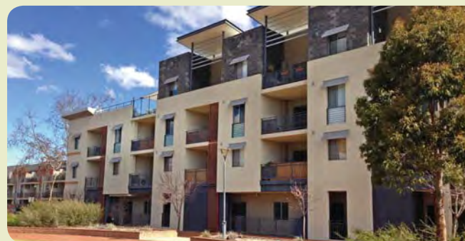
R100: Multiple dwelling apartments.