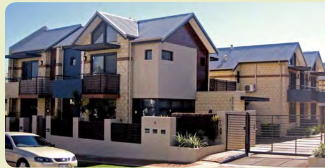
R80: Grouped dwellings, 10 dwellings on a 1278 m 2 lot.