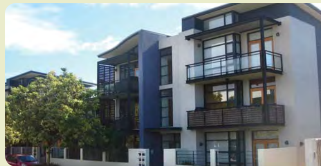
R80: Multiple dwelling apartments, 16 dwellings on a 2195 m 2 lot.