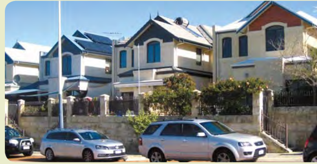
R40: Single dwellings, two storey development.