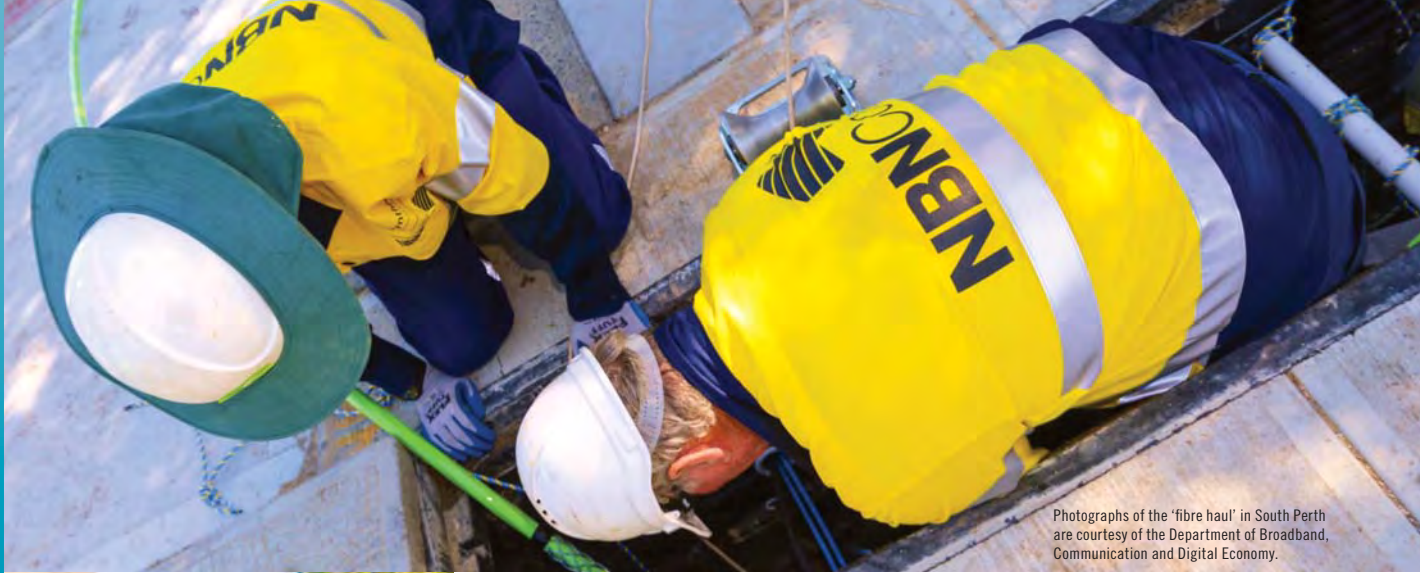
Photographs of the 'fibre haul' in South Perth are courtesy of the Department of Broadband, Communication and Digital Economy.