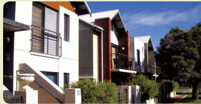
R60: Townhouse apartments, 10 dwellings to 1850 m 2 lot.