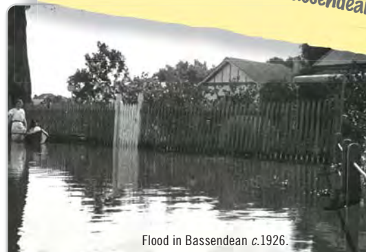
Flood in Bassendean c.1926.

Want quick access to what's happening in the Town? Then visit the Town's YouTube channel at www.youtube.com/townofbassendean .