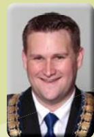
Cr. John Gangell Mayor

9279 1208 crgangell@bassendean.wa.gov.au f @GangellJohn