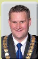
Cr. John Gangell Mayor

9279 1208 crgangell@bassendean.wa.gov.au f @GangellJohn