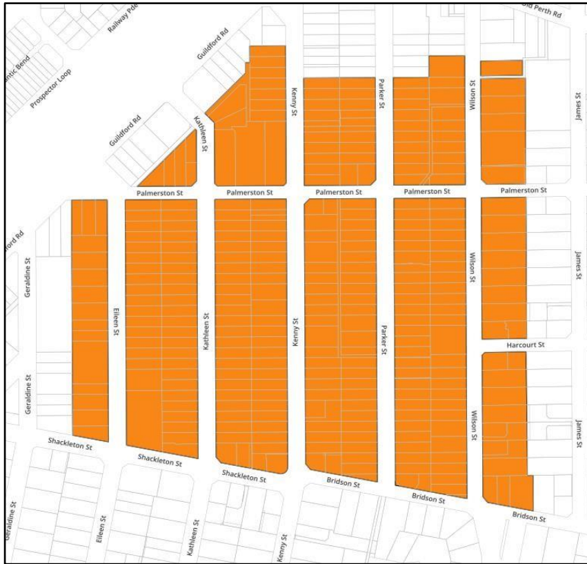
Kenny Street Heritage Area

Clause 9 of the Deemed Provisions of the Planning and Development (Local Planning Schemes) Regulations 2015 .