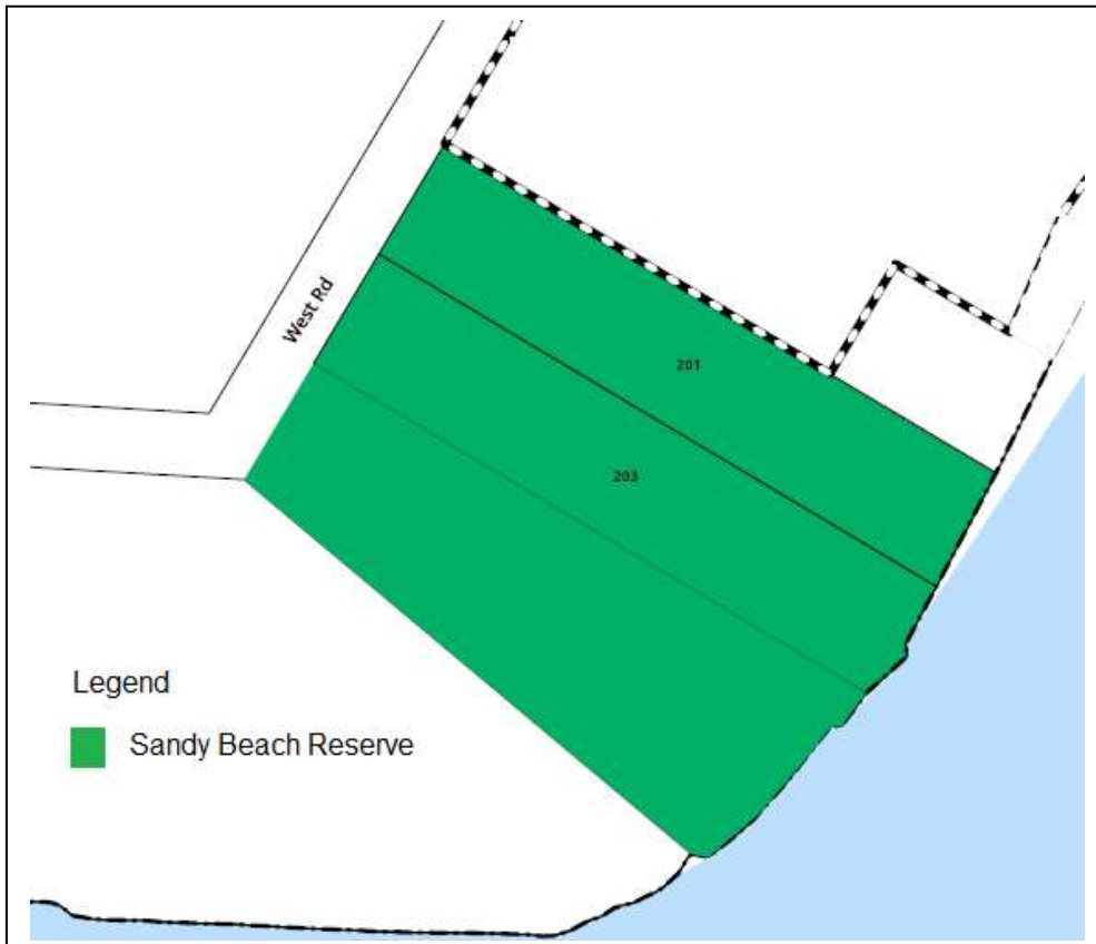
Map 3 – Sandy Beach Reserve, cat prohibited area