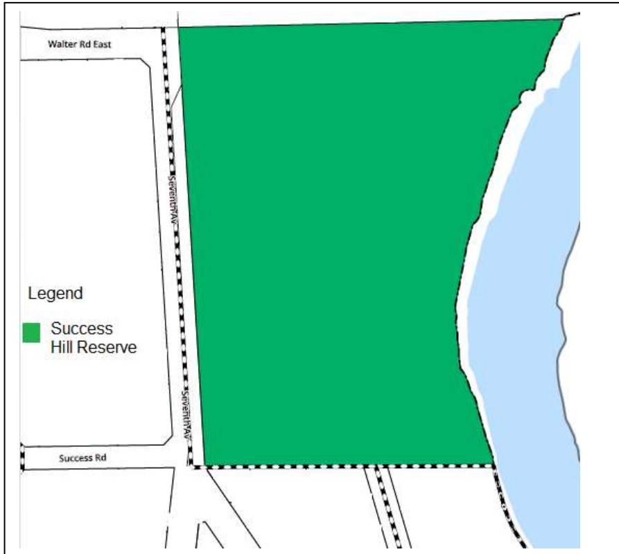
Map 4 – Success Hill Reserve, cat prohibited area