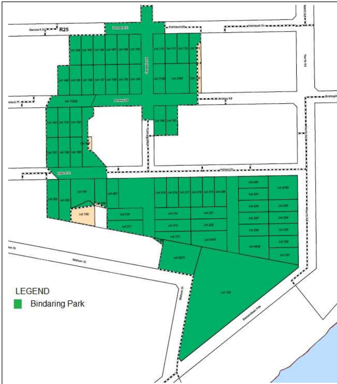
Map 1 – Bindaring Park, cat prohibited area