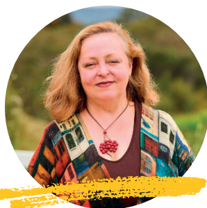
Cr Kath Hamilton Mayor

0408 725 555 crhamilton@bassendean.wa.gov.au