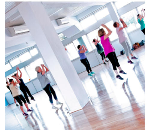
RElax Program – Zumba