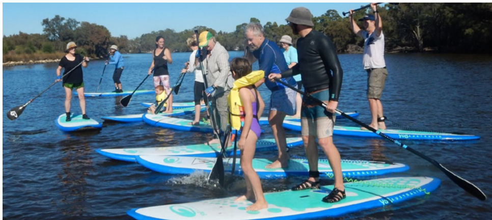
Stand Up Paddle Boarding, Sandy Beach Reserve

We look forward to your input and sharing the results with you in the coming period.