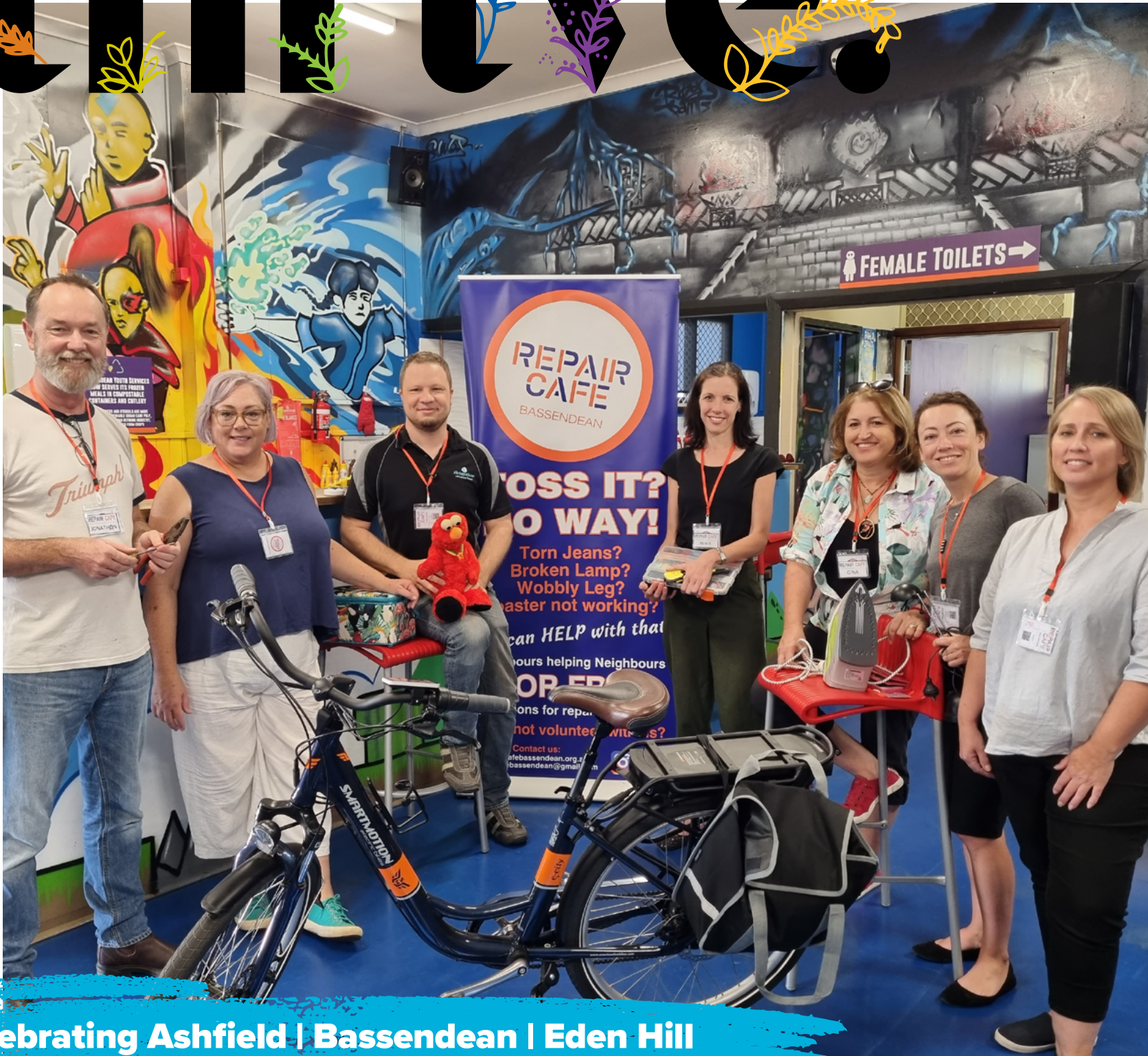
Celebrating Ashfield | Bassendean | Eden Hill